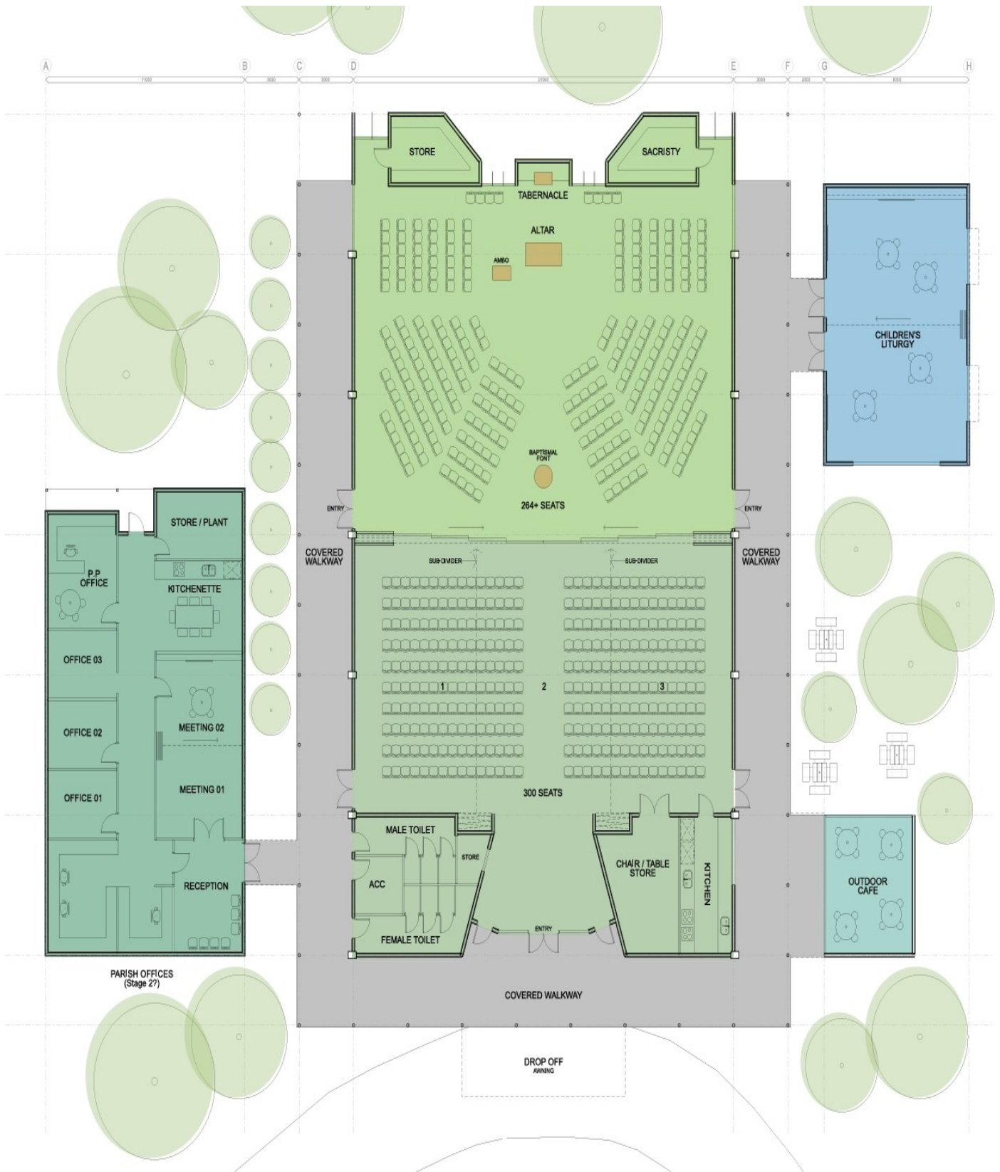
GROUND FLOOR PLAN scale 1:100

Please keep this important project, and the future life of our parish, in your prayers.