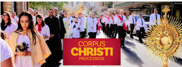
SUNDAY 11 JUNE | 2PM | CATHEDRAL OF ST STEPHEN

If you are required to hold a Blue Card, we ask that you please take part in the Level 1 Training for Safeguarding, this is online:- Level One Induction Video for Safeguarding and submit the form on completion. Thank you very much to those who Volunteer.